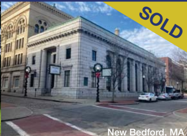
New Bedford, MA